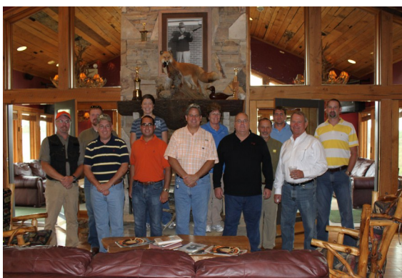
The clays had no chance.